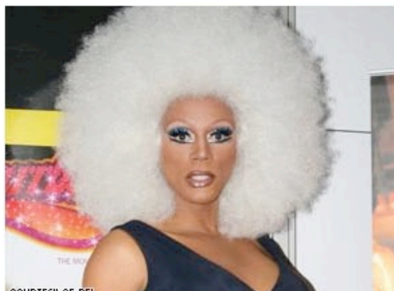
American actor, singer and drag-performer Rue Paul at the 22nd Lesbian and Gay Film festival.

LONDON, England (CNN) — As Hollywood stars such as Gwyneth Paltrow and Penelope Cruz grace the red carpet at the 52nd London Film Festival, the UK's capital city shows it has become a thriving, creative hub for filmmaking.